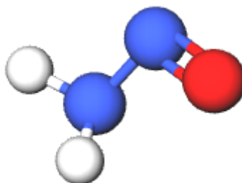
Figure 1. 3D structure of nitrosamine (H 2 N 2 O)

The term “Nitrosamines” is used to designate a vast group of N-nitroso compounds (NOCs), bearing an N–N=O side arm (Figure 1). Nitrosamines are formed by a reaction between nitrates or nitrites and certain amines both exogenously and endogenously. This reaction can occur, for example, under the acidic pH conditions found in the mouth or stomach. Nitrosamines and/or their precursors are widely distributed in the environment and can also be found in diverse consumer products such as processed meats, alcoholic beverages, cosmetics, and cigarette smoke.